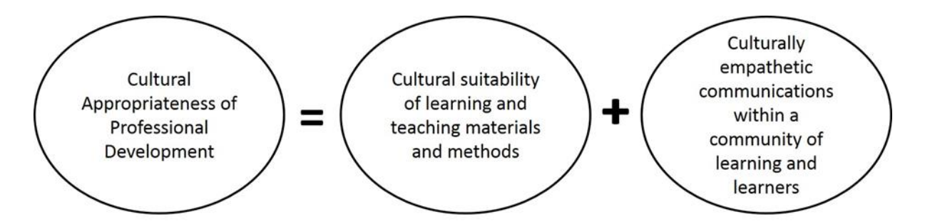
Figure 1. Model depicting elements of culturally appropriate professional development

Within this research, 'culture' is defined in a social sciences and humanities sense and refers to groups of people with a shared way of life through behaviours, beliefs, values, and symbols (Hofstede, 1997).